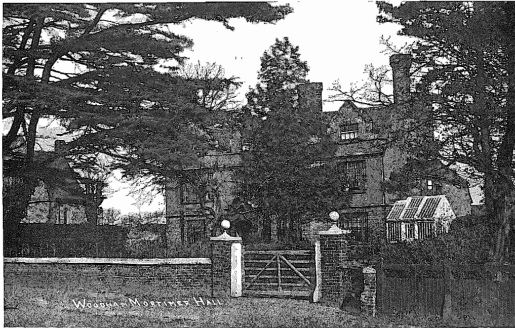
WOODHAM MORTIMER HALL, MALDON, ESSEX, where Dr. Peter Chamberlen (1601-1683) passed the later years of his life. Behind the cedar tree, on the left side of the picture, one may see the East end of the church. In the North-east corner of the churchyard, quite near to the Hall property, stands the monument which marks the Doctor's last resting-place—"the grave my hardest, but my easiest bed."