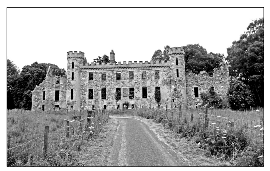
The ruins of Fetternear.

In 1691-3 Patrick Leslie transformed this much extended house into something approaching a Continental palace by rebuilding the central block