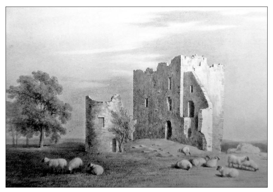
Balquhain Castle in the nineteenth century.