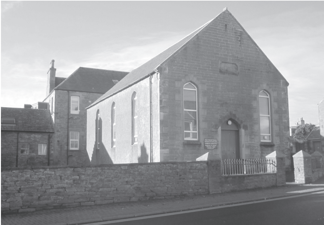
Above: The former RP church in Thurso, built in 1859. The congregation closed in 1928 and the building was sold to the Free Presbyterian Church of Scotland who continue to use it.

Below: Martyrs' Free Church of Scotland in Wick. Built in 1839 as an RP church, the building was retained by the Majority Synod in 1863, passing to the Free Church in 1876 and the United Free Church in 1900. It was sold back to the Free Church in 1914.