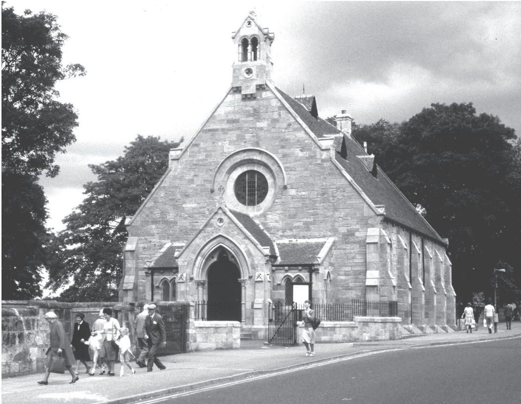
Wishaw RP church, 1984.

general trends and tone of the denomination as a whole, especially as these emerge from the activities of the leadership and its interaction with the membership at large. We know what absorbed the energies of the decision-makers and what issues most exercised them in the courts of the Church. And, now and again, we are afforded glimpses of the life of the body as a whole. Together, these provide materials for coming to some conclusions as to why things happened as they did.