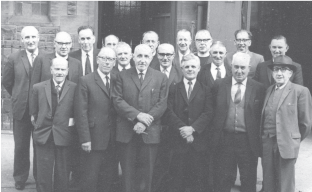
RP Synod 1971 meeting at the Nicholson St. church in Glasgow (the site is now part of the Glasgow Sheriff Court car park).