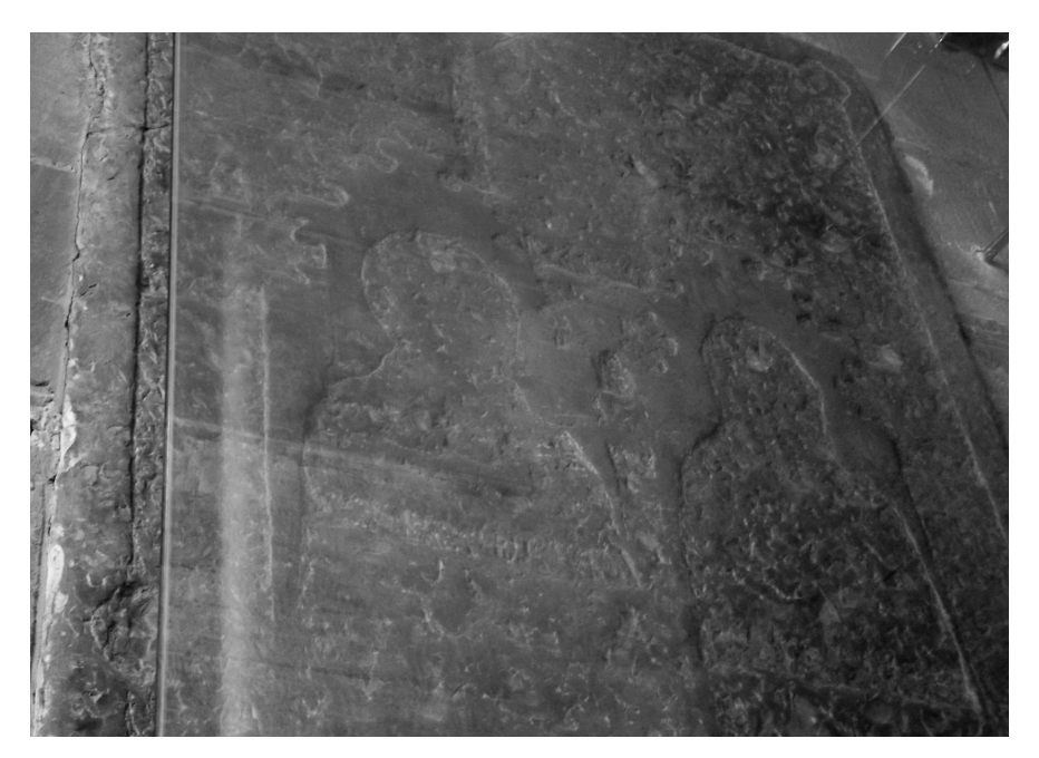
The tombstone of James I and Joan Beaufort, now on the east wall of St John's church.

destruction appears to have been thorough: the royal tomb of James I and Joan Beaufort was dismantled, presumably because of certain idolatrous features; while outside even the trees were destroyed, perhaps partly for military reasons. 88 Other than the valuables carried away by the prior, the only items known to have survived were a gateway that was subsequently incorporated into the parish church, though later demolished; 99 the doublet in which James I had been murdered; 90 a number of charters; 91 at least three books from the library; 92 and the royal tombstone of James I and Joan Beaufort. This formed part of the floor of the choir of the parish church for three centuries until it was moved to the east wall where it remains at present. 93