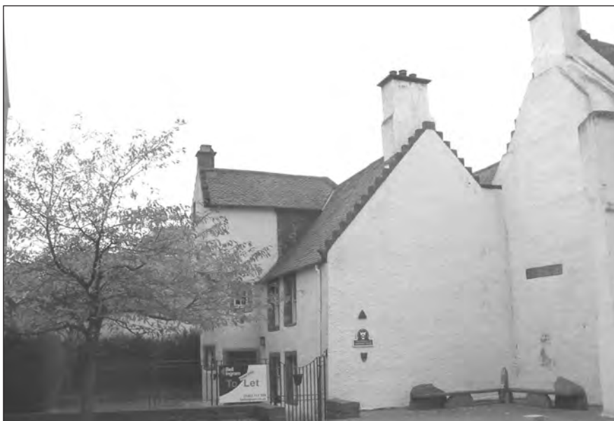
Abertarff House, Inverness, the town house of Lord Lovat.