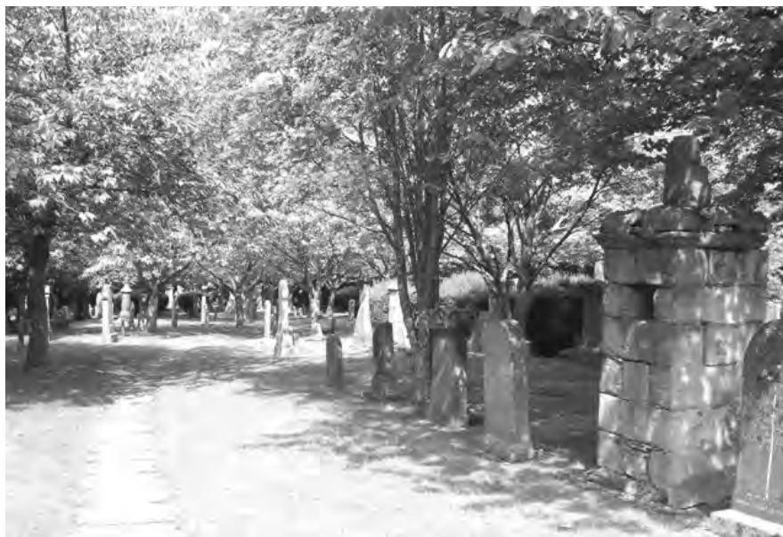
Chapel Yard burying ground, Inverness.