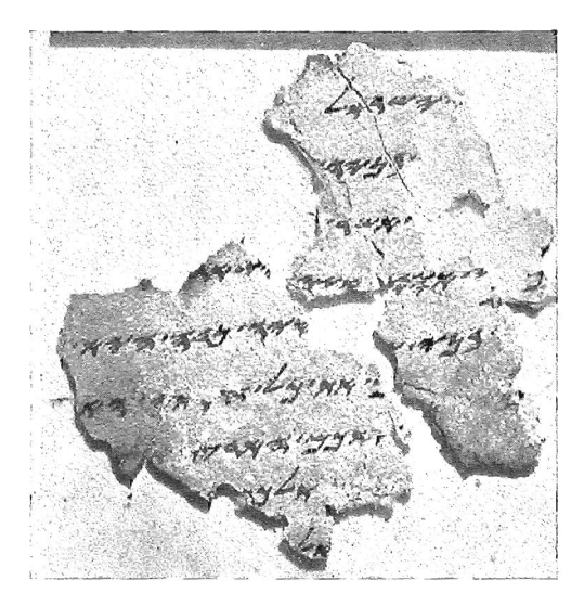
Fragments of Levilicus in the early Hebrew Script. 3rd or 4th century B.C.?