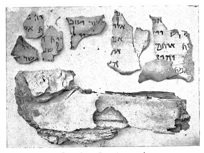
Parts of a scroll as yet unopened.