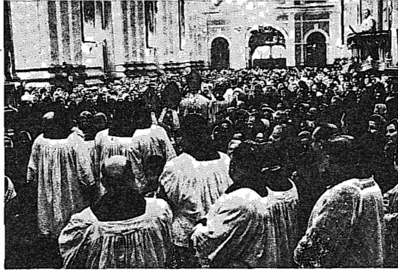
Above The consecration of Bishop Povilonis and Bishop Krikščiunas in Kaunas Cathedral in 1969. © Keston College.

Left Bishop Povilonis of the Lithuanian Catholic Church (front row, third from right) conducting a confirmation service in Dotnuva (Lithuania) on 14 July 1974. He is one of the signatories of a document (see pp. 89–91) which criticizes the draft of the new Soviet Constitution and which was sent to the Presidium of the USSR Supreme Soviet. © Keston College.