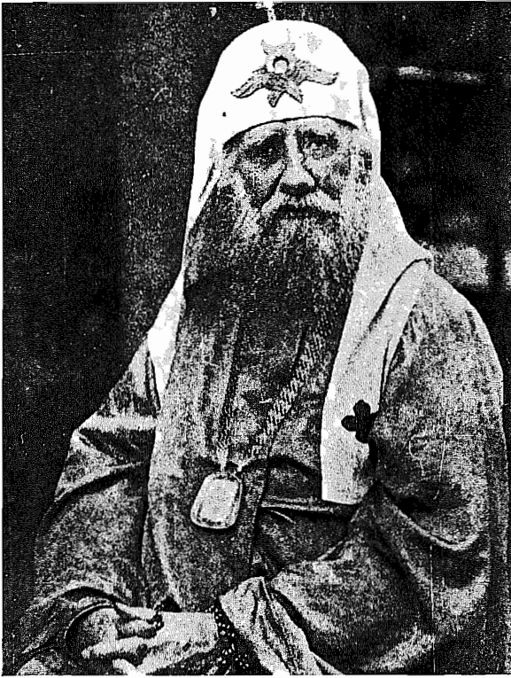
Patriarch Tikhon elected on 5 November 1917 at the Council of the Russian Orthodox Church.