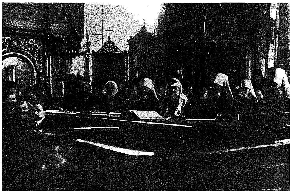
The Council of the Russian Orthodox Church held in 1917-18 (see pp. 17-25).