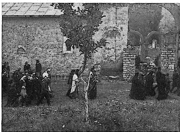
Nuns, priests, bishop and congregation process round the church at Sopotani monastery on St. Cosmas' and St. Damian's Day.

Below left : Whitsunday at the village of Duboka in Yugoslavia. Villagers process with offerings for the dead.