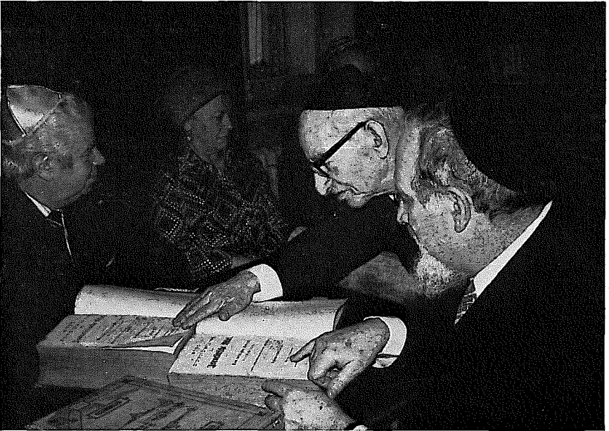
The Chief Rabbi examines an edition of the Vilna Talmud in the library at the Leningrad Synagogue.