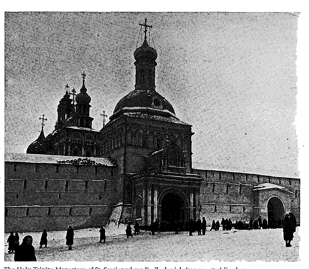
The Holy Trinity Monastery of St. Sergius where Fr. Zachariah (see pp. 42-5) lived as a monk.

Pilgrims at the Holy Trinity Monastery of St. Sergius (Zagorsk), one of the great spiritual centres in Russia today.