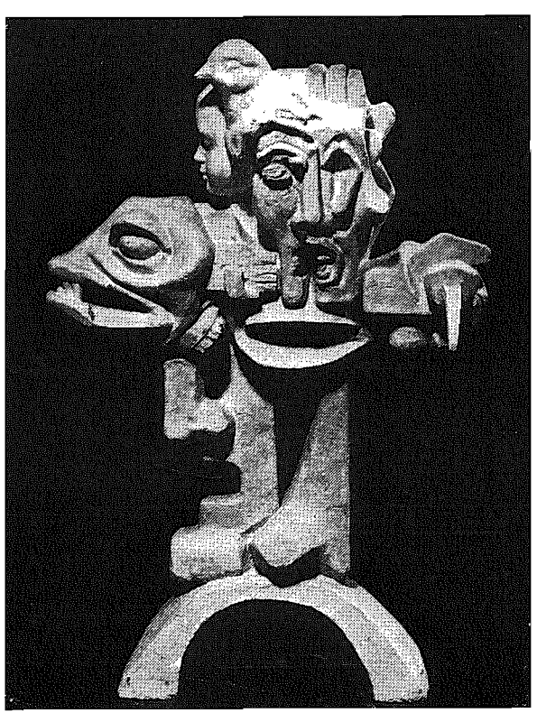
The theme of the Cross is seen in these two examples of Ernst Neizvestny's work.