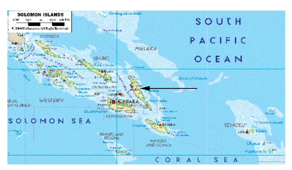
Figure 1. Map of the Solomon Islands, the arrow points to the location of Gula'ala

Allan Sanga is pursuing a Master of Theology at the Christian Leaders' Training College in Papua New Guinea. He comes from Malaita Island in the Solomon Islands.