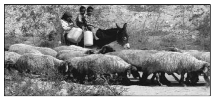
Fig. 5: People, sheep, and donkey<sup>21</sup>

Photographs can be instrumental in providing impressions of the fauna, flora, and landscape of biblical settings, which are unknown to most new readers. With photographs, the temple of Jerusalem, or a camel, for example, become vivid and "real". However, when anachronisms creep in, the historical integrity of the translation becomes extremely questionable. If this happens, its quality is diminished, in the end. An example of such a blurring of temporal distance would be the plastic containers, carried by a donkey (Fig. 5).