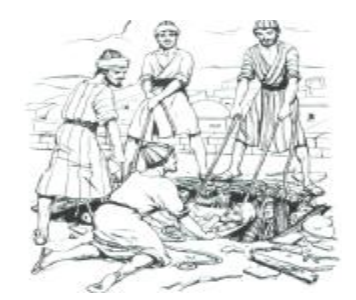
Fig. 3: (Nupela Testamen, Luke 5:19) Fig. 4: (Buk Baibel, Mark 2:4) Letting a paralysed man down through a roof<sup>19</sup>

When we compare both drawing styles (Fig. 3; Fig. 4), it becomes evident that the Buk Baibel illustrations far exceed those of the Nupela Testamen, in their degree of realism. Although neither was intended for receptors in Papua New Guinea, in the first place, the more naturalistic, but not overloaded, style of the drawings<sup>20</sup> increases the amount of immediate information, not only for new readers. With illustrations like these, FE is potentially higher – particularly when these include captions relating to a text passage, as in the Buk Baibel. Thus, the choice of illustrations in the Buk Baibel can be considered more felicitous, with respect to the intended recipients, and their understanding of the content, respectively.