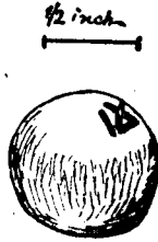
FIG. 2.—PALESTINIAN WEIGHT WITH PREVIOUSLY UNKNOWN SYMBOL.