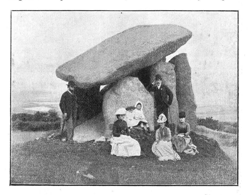
FIG. 1.—THE TREVETHY CROMLECH, NEAR LISKEARD.

remarkable in form and outline as at first sight it might be regarded as the work of man, a monument erected over the grave of some prehistoric giant by his brother "giants of those days" who have left their monuments in the stone circles and dolmens of Britain and Western Europe. But a closer inspection dispels this illusion; and we ultimately recognize