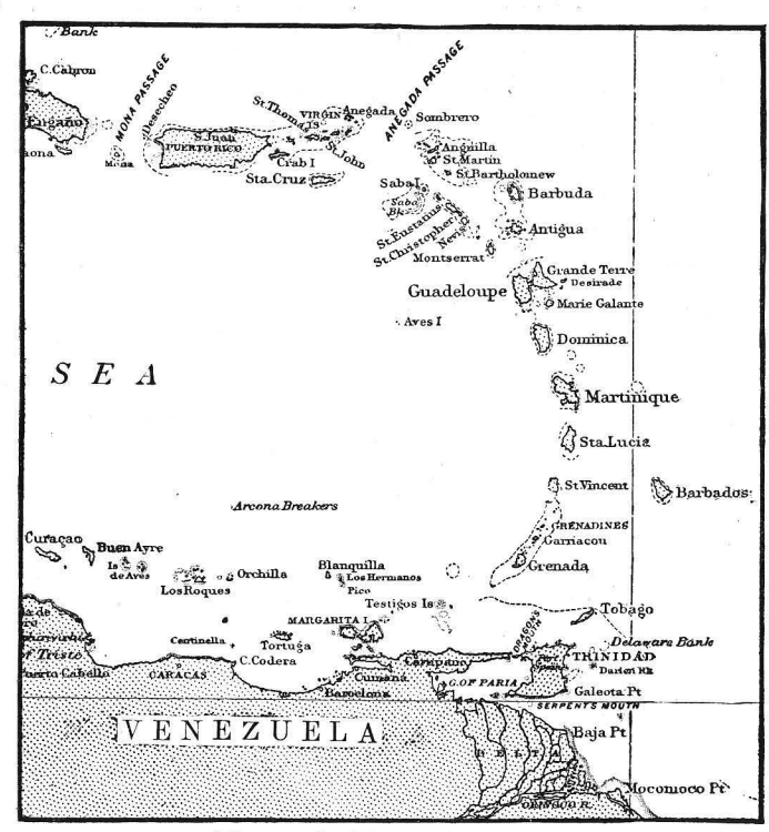
Map of the West Indian Islands.