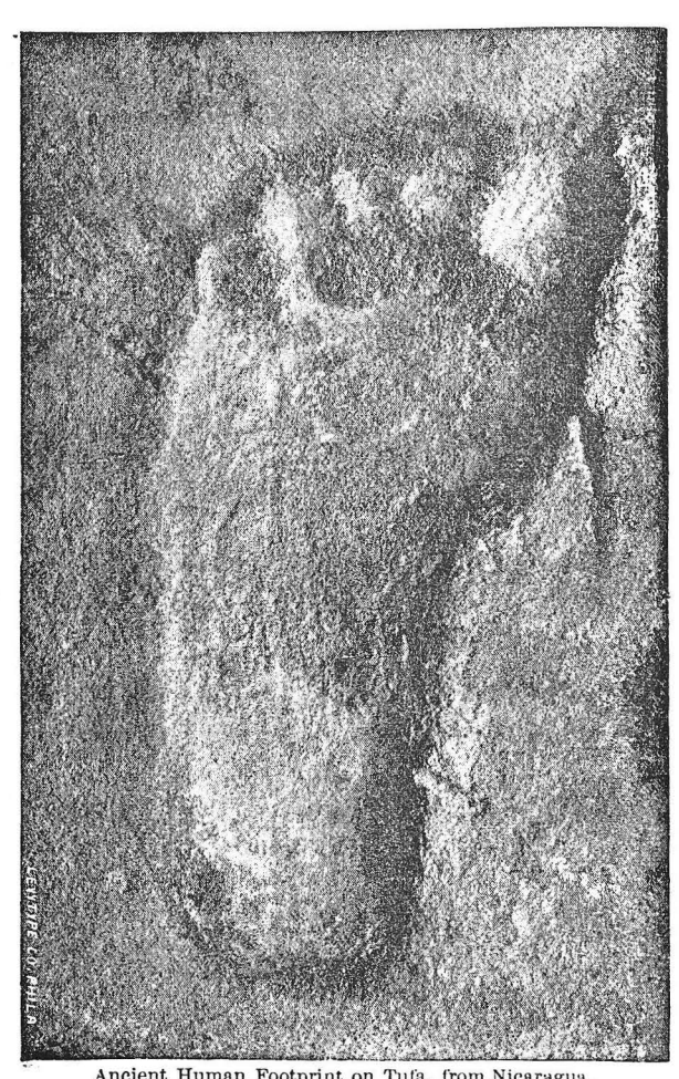
Ancient Human Footprint on Tufa, from Nicaragua.