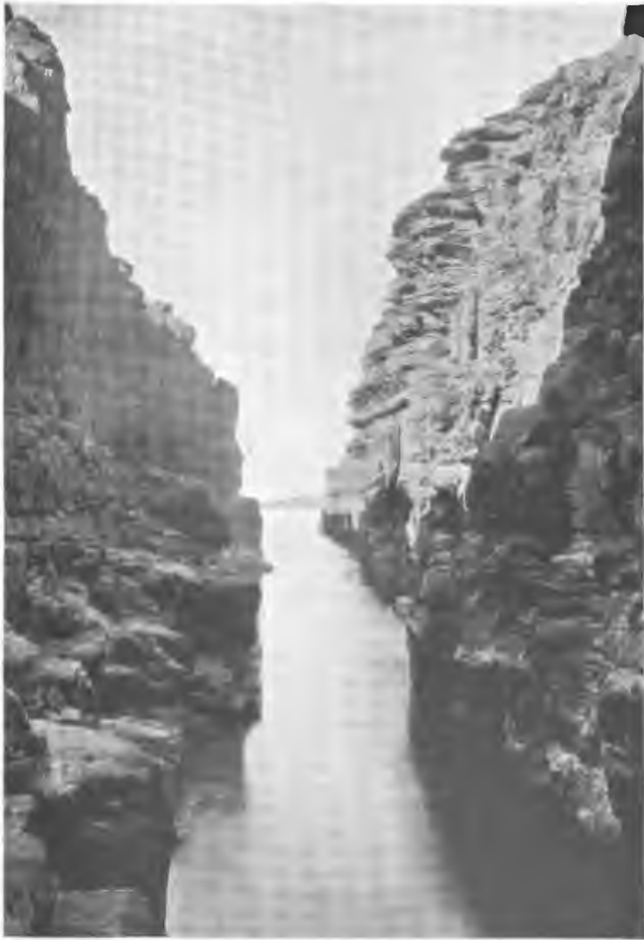
FIG. 4. — MOUTH OF THE ARNON FROM THE EAST