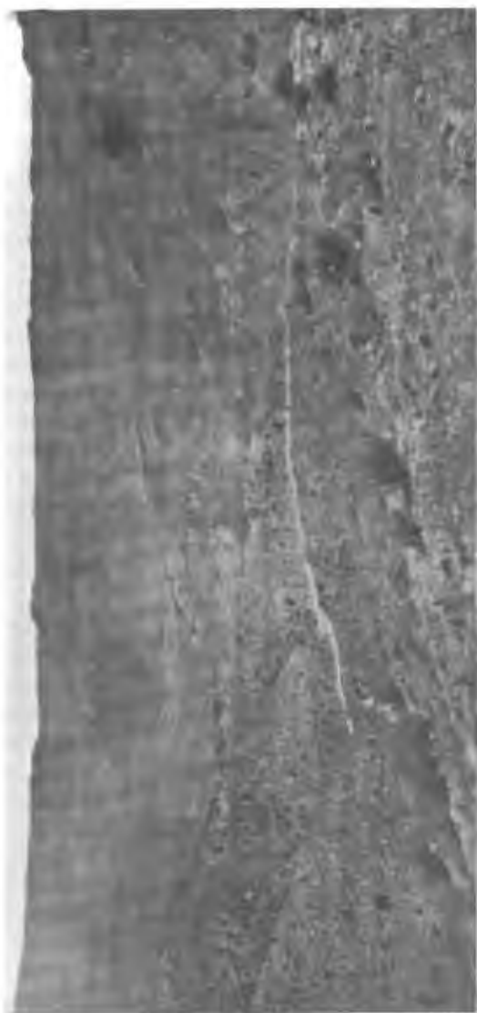
FIG. 7.—THE ANNON NEAR THE PLACE OF CROSSING