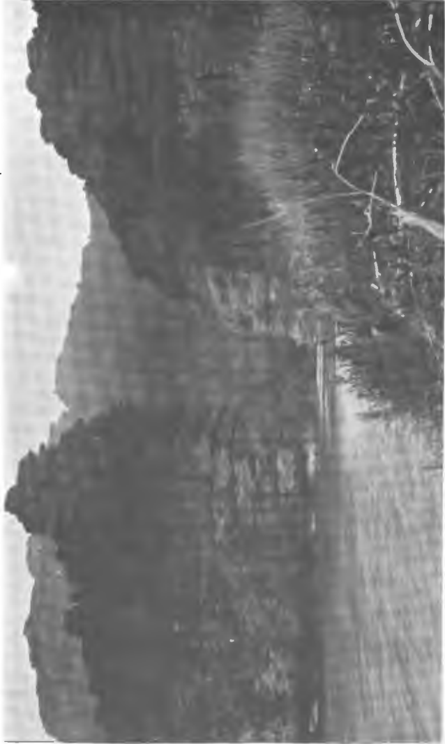
FIG. 1. — MOUTH OF THE ARNON FROM THE WEST