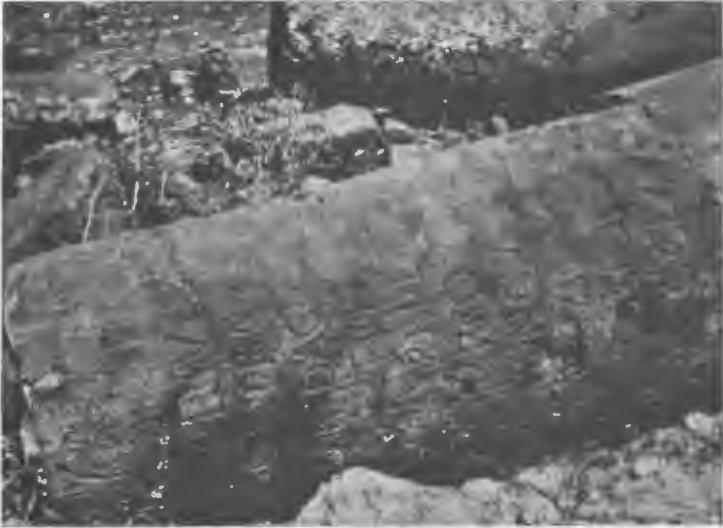
FIG. 8. — MILESTONE ON THE SOUTHERN SIDE OF THE CROSSING