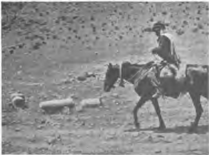
FIG. 9. — MILESTONES ON THE NORTHERN SIDE OF THE CROSSING