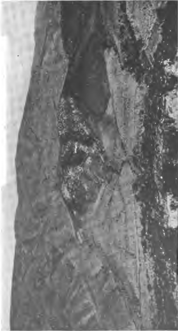
FIG. 10. — THE ARNON FROM THE MOUNTAIN NORTH OF THE CROSSING