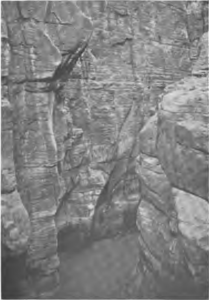
FIG. 8. — FIRST BEND OF THE ARNON TO THE SOUTH