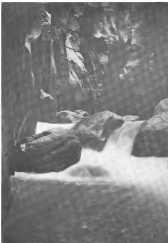
FIG. 5.—THE FIRST WATERFALL FROM THE WEST