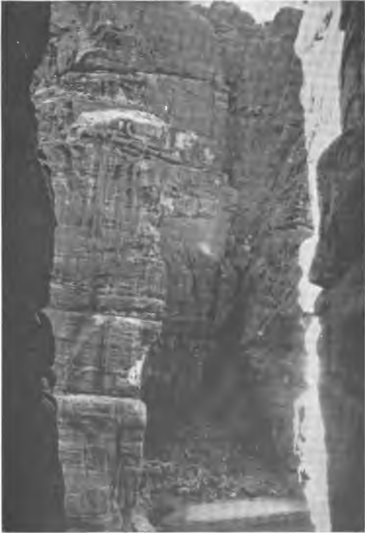
FIG. 2. — SOUTHERN WALL BELOW THE BEND OF THE ARNON