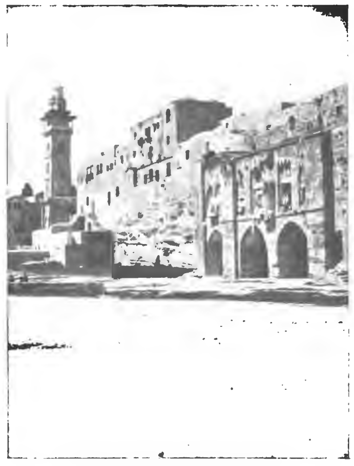
THE NORTHWEST CORNER OF THE HARAM.