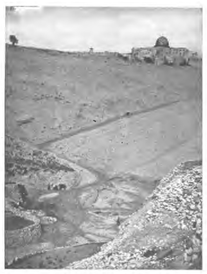
THE PATH FROM 'AIN SITTI MARYAM TO THE CITY.