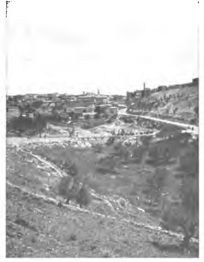
WADY RABĀBI. A view northward of the part that bounded the city on the west.