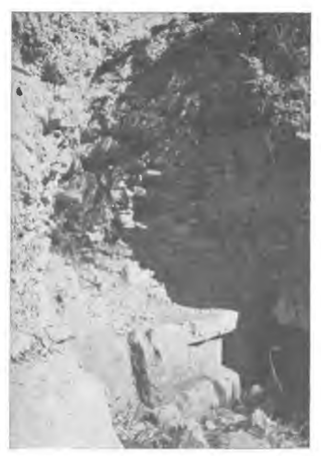
THE RAVINE GATE. The ruined entrance discovered by Bliss, and wrongly identified with the Dung Gate.