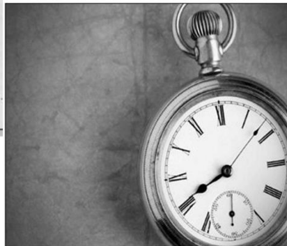
JOHN ALBRECHT BENDEL'S GNOMON OF THE NEW TESTAMENT: POINTING OUT FROM THE NATURAL FORCE OF THE WORDS, THE SIMPLICITY, DEPTH, HARMONY AND SAVING POWER OF ITS DIVINE THOUGHTS. VOLUME 1