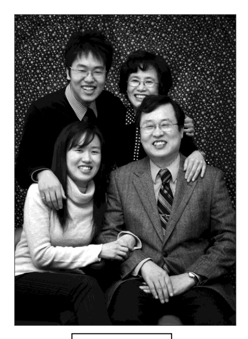
The No family