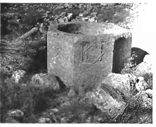
Baptismal font--Byzantine period.