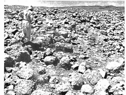
Surface of Tekoa showing Byzantine and Crusader ruins.