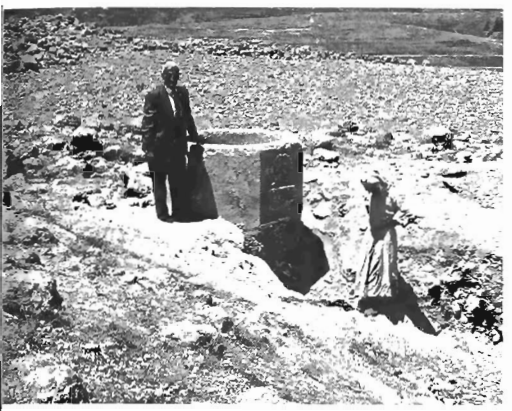
Baptismal font -- Byzantine period.