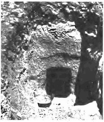
Entrance to Iron Age tomb.