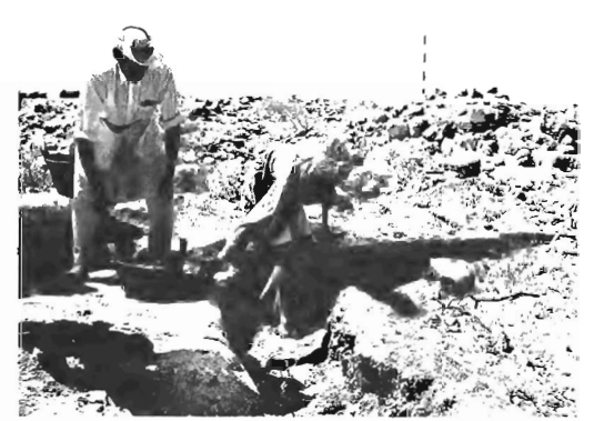
Church apse in process of being cleared.