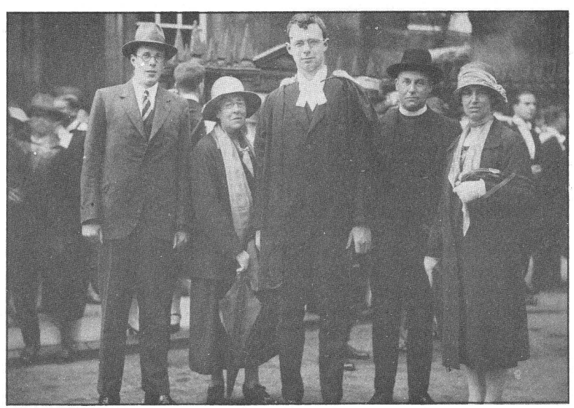
Graduation, June 1928

In 1928 most of us went down with our second-class degrees, while