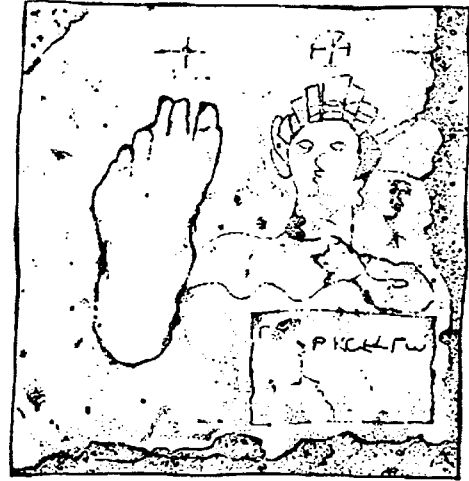
Fig. ii. Graffiti in Marble Street

Yet interpreting the available evidence is difficult. An example of this might be the discovery of the terracotta image of Bes with his outrageously enlarged penis (fig. iii) or