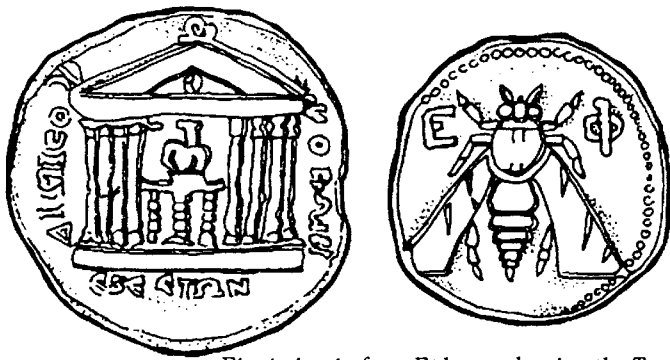
Fig. i. A coin from Ephesus showing the Temple of Artemis together with her image.

The extant knowledge of the ancient city of Ephesus is vast. 1 It is known that in the first century it was near the height of its importance. 2 With a population of over 200,000, it was smaller in size only than Rome and Alexandria within the Roman Empire (and, probably, of greater importance than