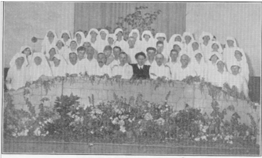
Some of the candidates at a recent baptismal service at Ryde.

Early in August the Sunday School had their first summer outing on this occasion going to Southsea, where a very enjoyable time was spent. Tea was followed by games and races.