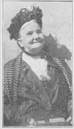
The Blind Match-seller.

This face has attracted many a passer-by and caused them to stop and wonder. In one case it caused a young woman who was passing to stop. She had a mother who was permanently bedridden, and she said to herself, "I wish my mother could see this old blind woman's face, with its empty sockets that once were eyes, and to be able to see the happy and contented look and expression she carries." The young lady was able to obtain a photograph of the old blind lady, and took it home to her mother who placed it in a little frame on the table beside her bed. I had the pleasure of reading and then answering for this old blind lady a letter that the bedridden lady had sent to her from the country, in which she said that at times when she got weary and sad and depressed, lying there in her bed from which she was unable to