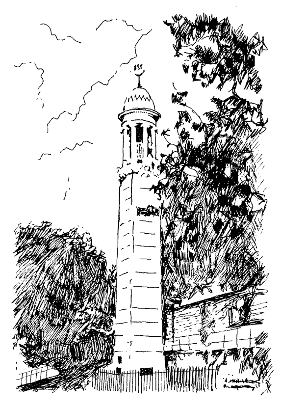
The Mayflower Memorial, Southampton

bad. So curiosity and a broadening of experience are both motives for studying church history.