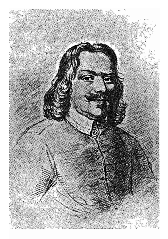
JOHN BUNYAN 1628—1688

From the original Drawing by Robert White in the Cracherode Collection in the British Museum. (By kind permission.)