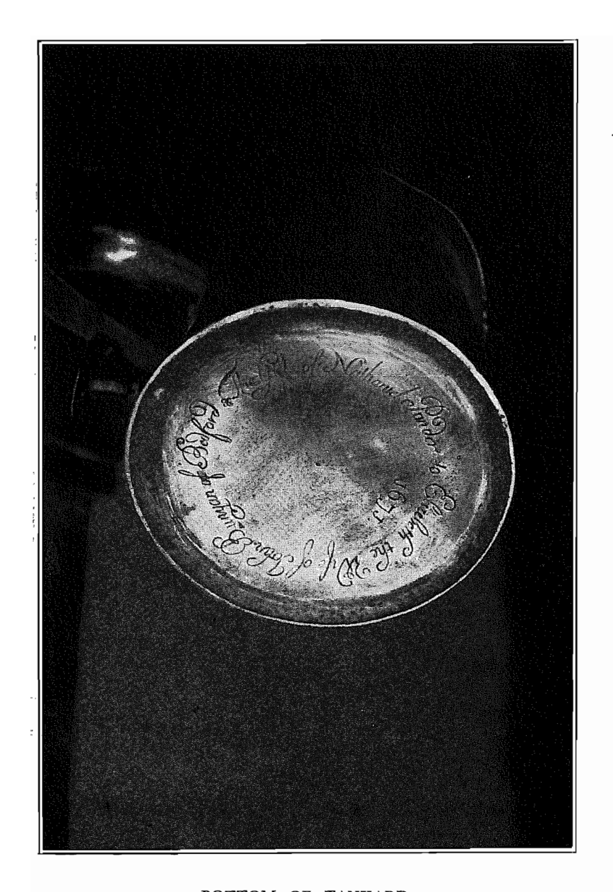
BOTTOM OF TANKARD. (Reproduced by kind permission of the Owner.)