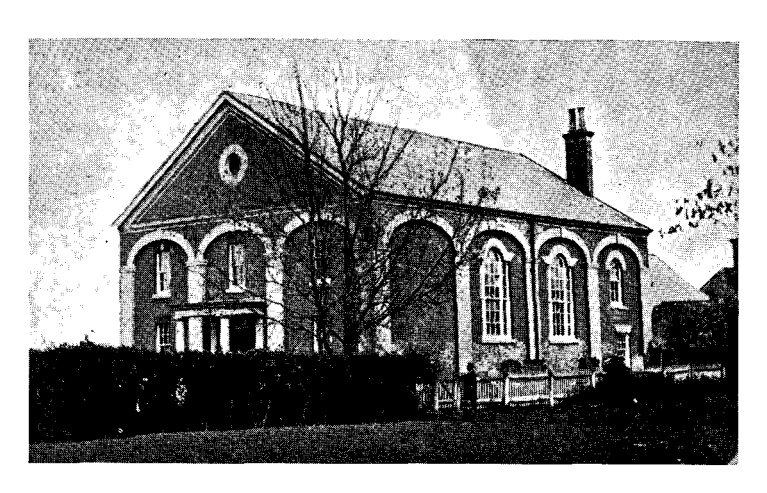
Baptist Chapel, From the south-west.