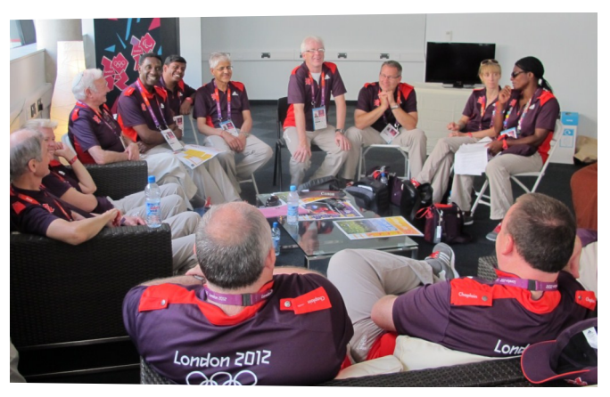
Chaplaincy meeting at the Games

ticket booth, gift shop, florist, restaurants and many others. All these are present to cater for various personal needs in the Athletes' Village. In 'Faith the Centre' spiritual needs are met. Not everyone needs everything. So it is for chaplaincy. For different people, chaplaincy may be either irrelevant or invaluable.