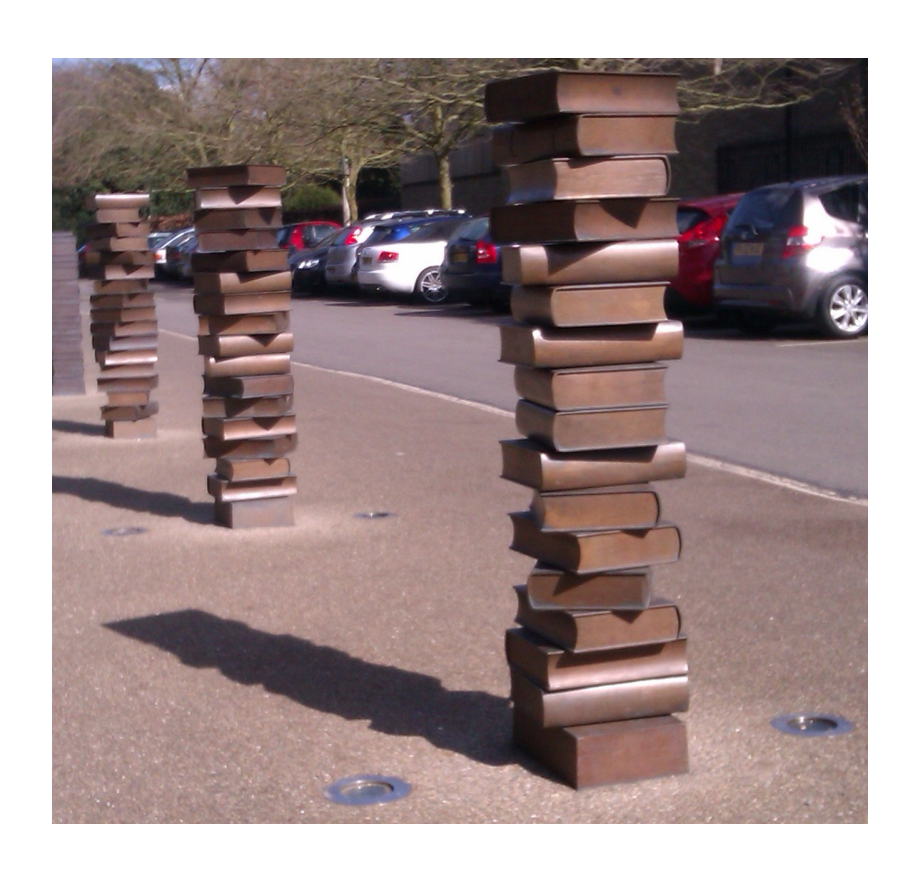
Volume 22, Number 2 June 2015