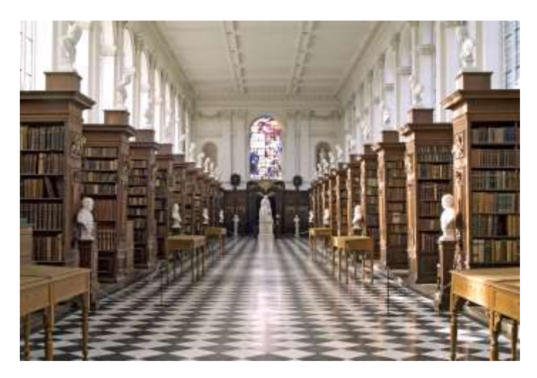
The Wren Library

flowers all by Grinling Gibbons. In addition there is sculpture by Rysbrack, Roubilliac and Scheemakers. There is a superb statue of Lord Byron by Bertel Thorvaldsen which came to the library in 1845 following its rejection by the authorities of Westminster Abbey who would not contemplate the presence of an image of this most scandalous of men in Poets' Corner.