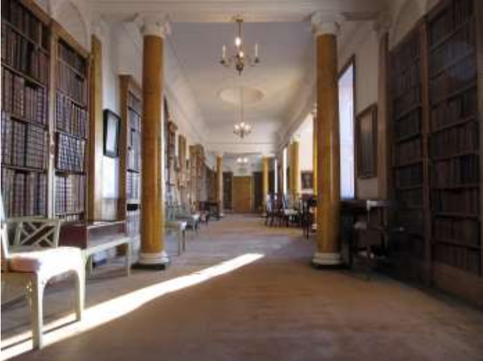
The Hurd Library