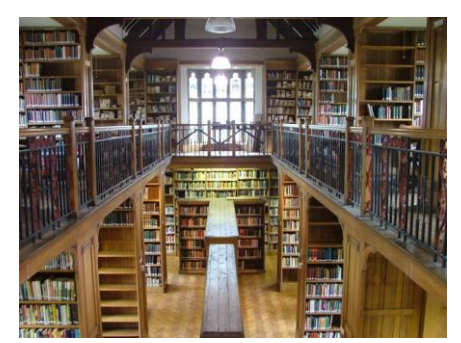
Glancey Library, Oscott College, July 2009

BULLETIN of ABTAPL Vol. 17, No. 3, November 2010