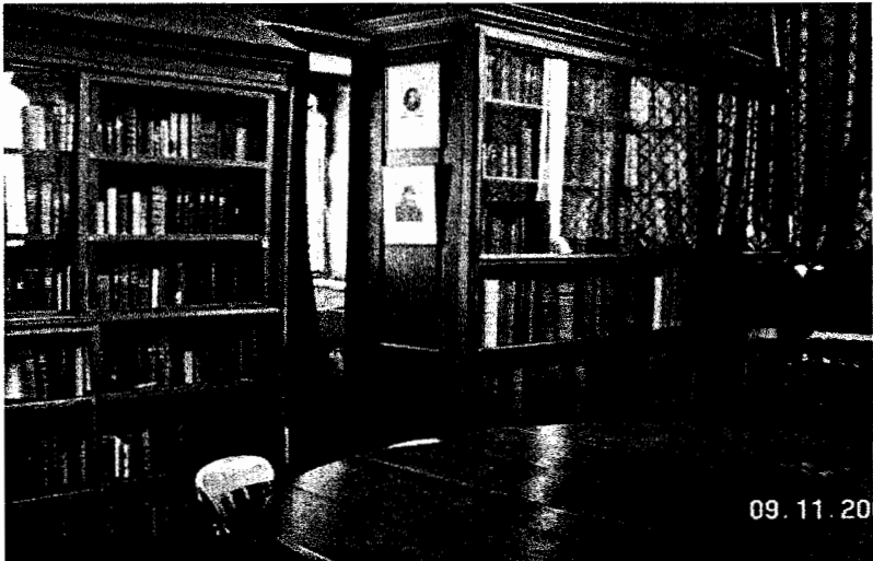
Library of Saint Botolph's Church, Boston